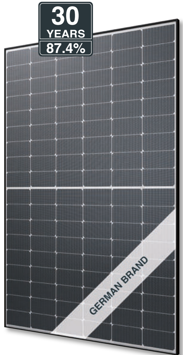
Fig. similar 108TFMLEN241030A